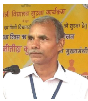
By: Er. Prabhat Kishore

World is going to celebrate "International Day of Sign Language" on 23rd September for the full realization of the hearing impaired people. Sign language is the means of communication through body movement, specially hand, finger, arm, head and facial expressions besides particular symbols developed. This practice is more older than speech.