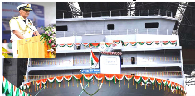
The Diving Support Vessel Nistar at HSL, Visakhapatnam. (Inset: CNS Admiral R Hari Kumar).